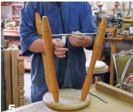
To get an accurate measurement for your rungs, push two sections of all-thread rod into the rung holes, then tape together the rods. The rod threads lock onto each other, preventing slippage when you remove the legs from the seat.

upper and one lower hole at 90 degrees to one another on each leg. Use a centerpunch to mark the hole locations.