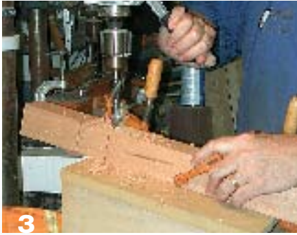
Using a jig angled at 15 degrees, bore the 3/4"-diameter holes in the legs for the rungs. Use a straightedge to keep the holes aligned.