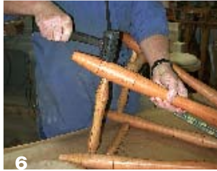
After dry-fitting the stool, assemble the rungs in the legs.

With a 3/4" brad-point bit, bore the rung holes 1" deep. It is important to hold the leg securely to prevent