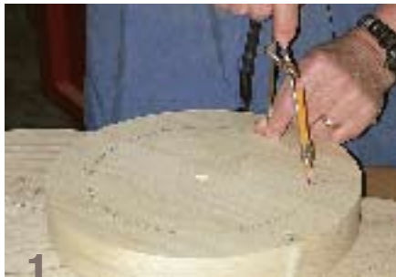
1 Using a compass, lay out the leg positions on the bottom of the stool seat.

Add a V-block to the jig (two ¾×2×7" scrap pieces are ideal) to support the blank and simply rotate it to the proper positions for drilling the holes. Without the V-block, you will need to clamp the blank to the jig to prevent it from slipping. The wedge beneath the jig is cut at a 10- or 15-degree angle. If you do not have a drill press, you can use a hand drill or even a brace and bit. Either method requires a sliding bevel for proper angle alignment.