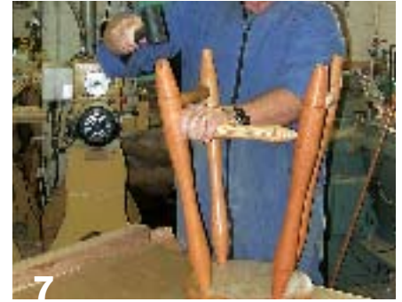
Use a dead-blow mallet to drive the legs into the seat.

it from sliding on the jig. Although the angle mirrors the 15 degrees for the seat, I have a second jig set with a straightedge attached so it is easier to hold the leg in place while drilling ( Photo 3 ). You can also wait until after you turn the legs to drill them, but then there are greater challenges to holding the legs in place.