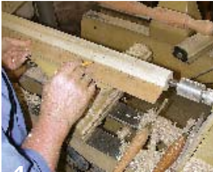
A pencil or marking gauge (sometimes called a story board) will help you turn four matching legs. After you've finished one leg, place the sample leg behind your lathe to use as a reliable reference.